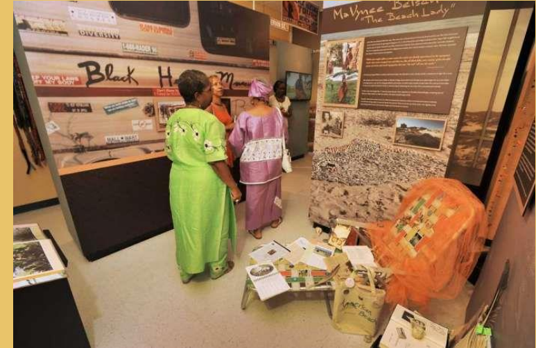
American Beach Museum